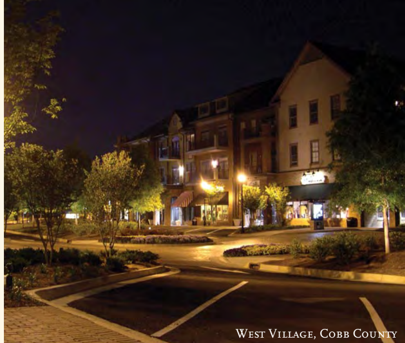
WEST VILLAGE, COBB COUNTY