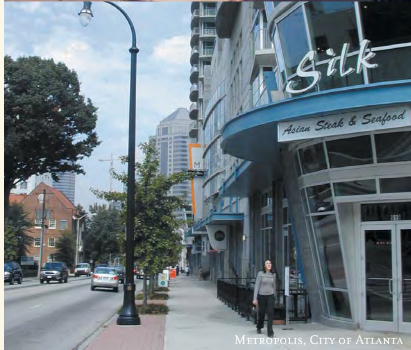
METROPOLIS, CITY OF ATLANTA