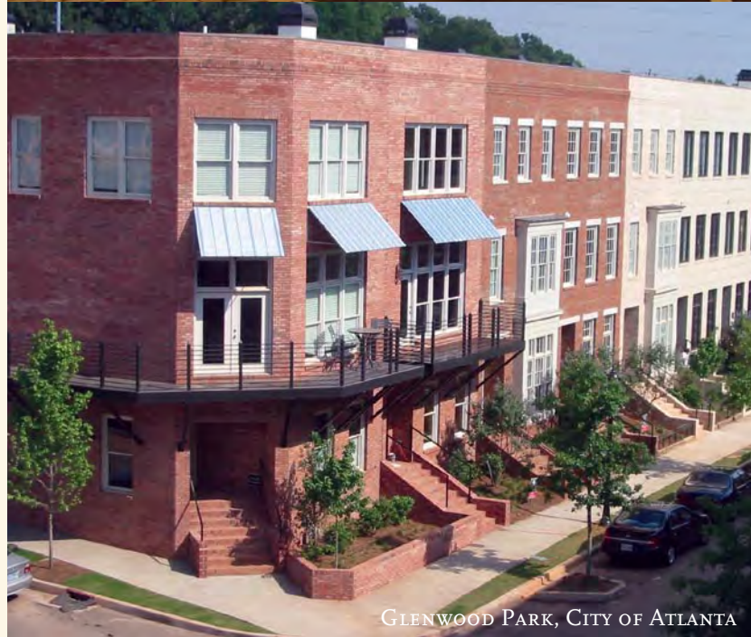
GLENWOOD PARK, CITY OF ATLANTA